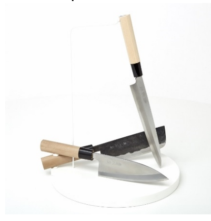
Photo: Set of Japanese kitchen knives showing a 'Deba bōchō' in the foreground, used to chop fish or meat, a square-bladed 'Nakiri bōchō' for vegetables and a 'Yanagi-ba-bōchō' used to make sashimis.

In certain cases, preparation techniques may be subject to particular rules belonging to particular cultures. An example of this would be the technique for cutting up raw fish in Japan.